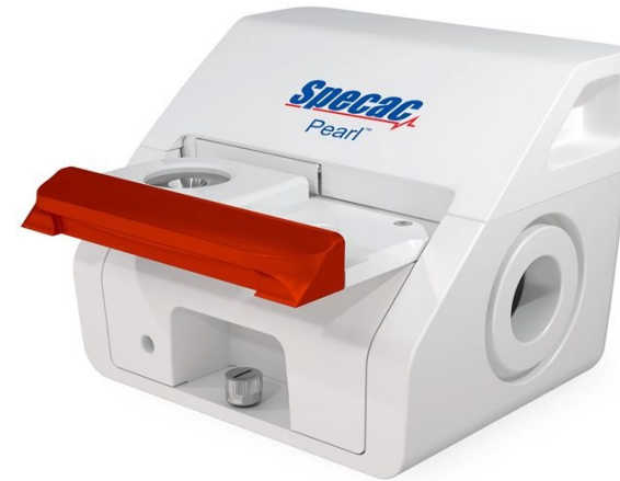
Pearl Liquid Analyzer