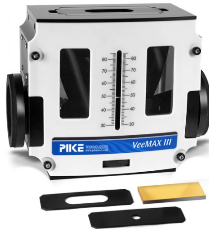
VeeMaxIII Variable Angle FTIR