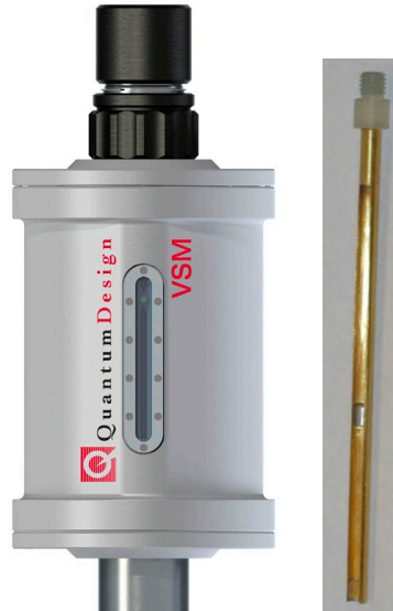
VSM Up to 3 Tesla