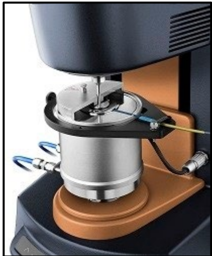
Magnetorheology Up to 1 Tesla